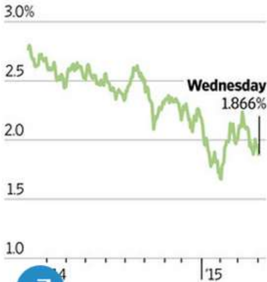
Yield on 10-year Treasury note